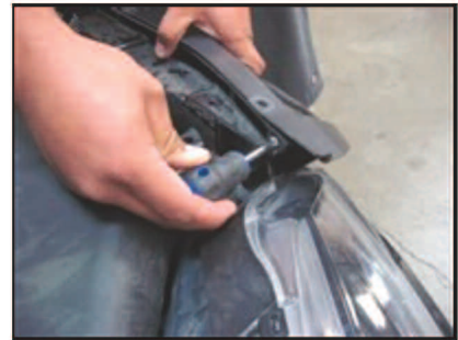
Picture #3: Remove the right & left corner screws located on the back side of the grille shell as shown using a stubby "Short" screwdriver.