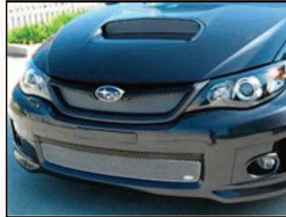
Picture #20: 2011-2012 Subaru WRX shown here with hood scoop, lower and upper silver mesh grilles.