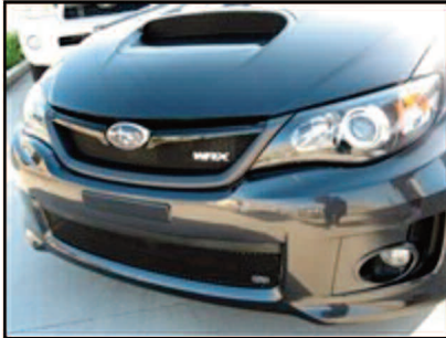
Picture #19: 2011-2012 Subaru WRX shown here with hood scoop, lower and upper black mesh grilles.