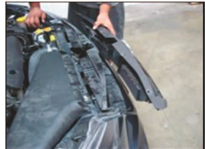
Picture #6: Once all the backside screws are removed the grille shell can then be removed from the vehicle.