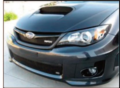
Picture #21: 2011-2012 Subaru WRX shown here with hood scoop, lower and upper black mesh grilles.