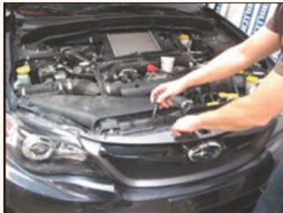
Picture #4: Pull forward on the upper grille in order to gain access to the back side of the grille shell screws.