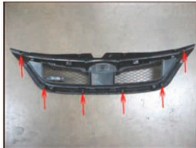
Picture #5: Shown here are the locations of the grille shell screws that must be removed.