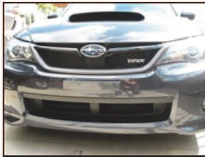
Picture #1: Our project Subaru Impreza WRX in need of a custom mesh grille kit.