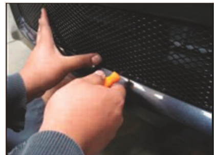
Picture #9: Using a sharp scribe mark the(3)grille mounting tab locations onto the bumper.

The information contained in this document is meant as helpful guidance only and is subject to change without notice. You are welcome to call, write or email us for more information at any time. Thank you for your interest in our products. This document was published 07/17/12.