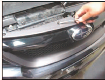
Picture #2: Remove all the plastic fasteners along the top of the grille shell.