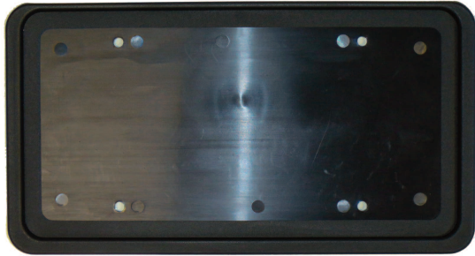
RP-14 • Front

Fits most vehicle years, makes or models. Comes with 4 screws and 4 screw covers